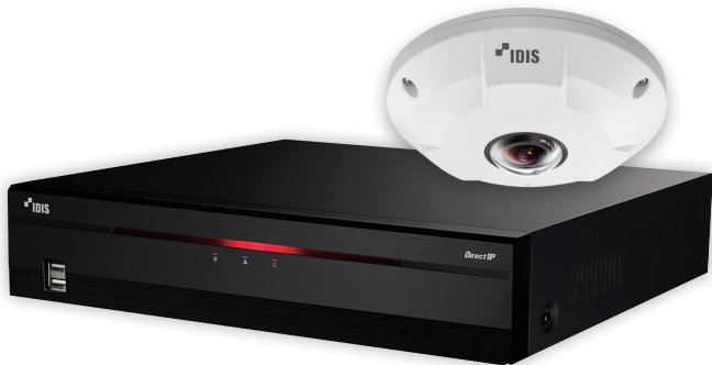
IDIS Fisheye (DC-Y1514), IDIS NVR (DR-2216P)

The IDIS Total Solution also included IDIS Center, a full-featured and license-free VMS with all the functionality of a traditional VMS and none of the burdensome costs. The low total cost of ownership of the entire IDIS solution allowed La Familia to maximize their surveillance hardware capabilities and ensure hassle-free security across their multiple locations.